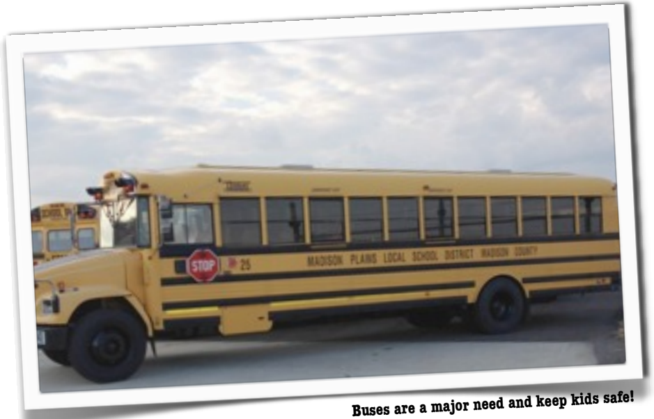
Buses are a major need and keep kids safe!

The district has not increased taxes since 2005. Since then, the district has curbed spending by reducing staff, consolidating buildings and capping the district's contribution to